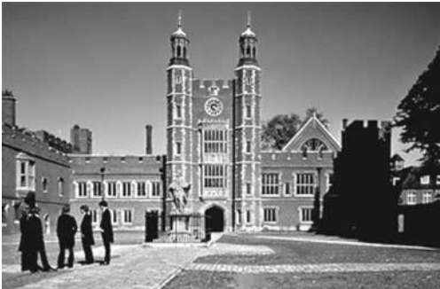
Eton showing the students' uniform